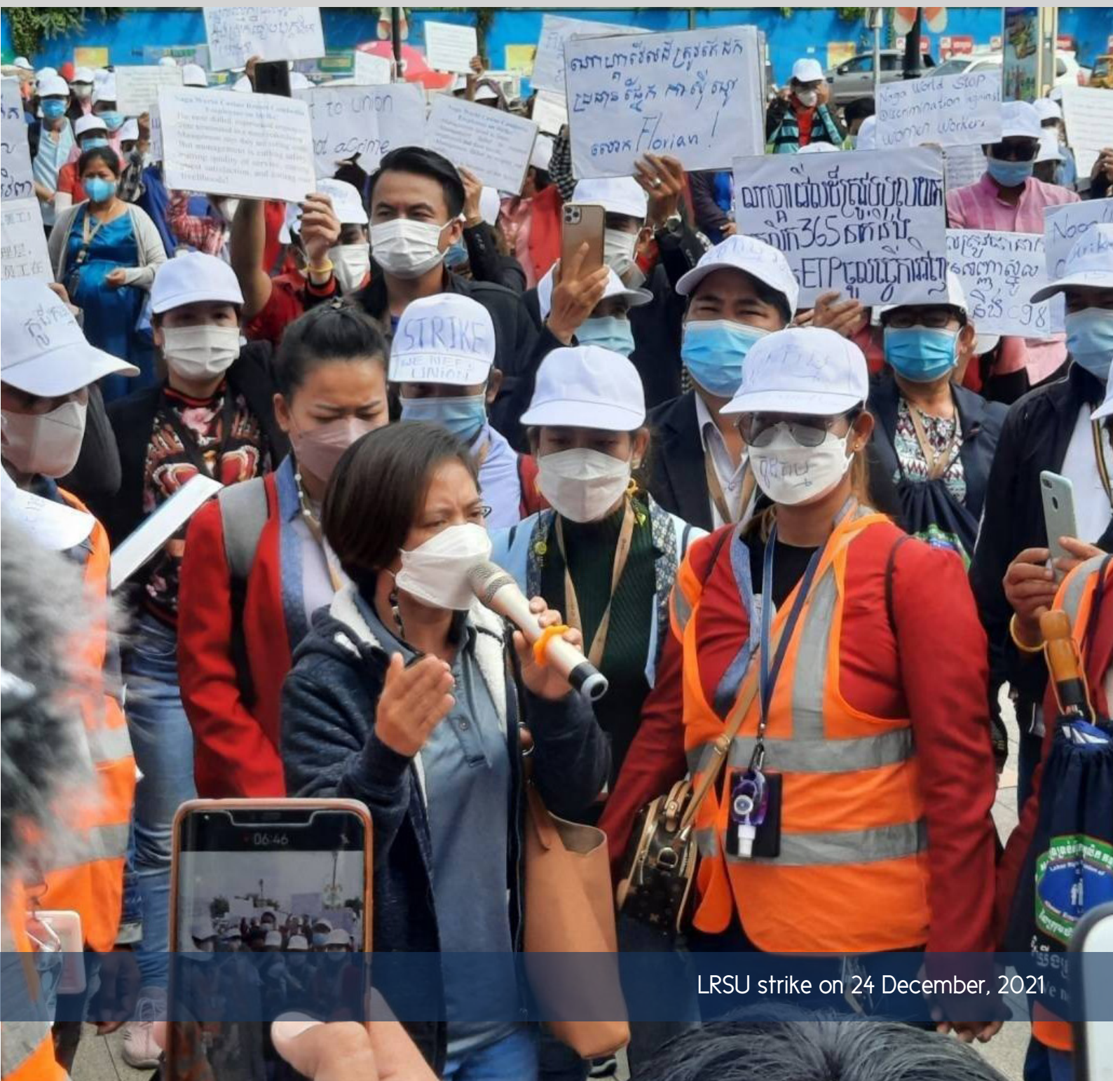
LRSU strike on 24 December, 2021