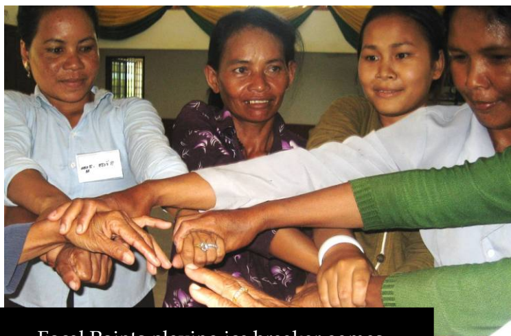
Focal Points playing ice breaker games

LICADHO conducted a second three-day training session from 4 - 6 October, 2006. Due to the amount of material that needed to be covered, the training session was extended to three