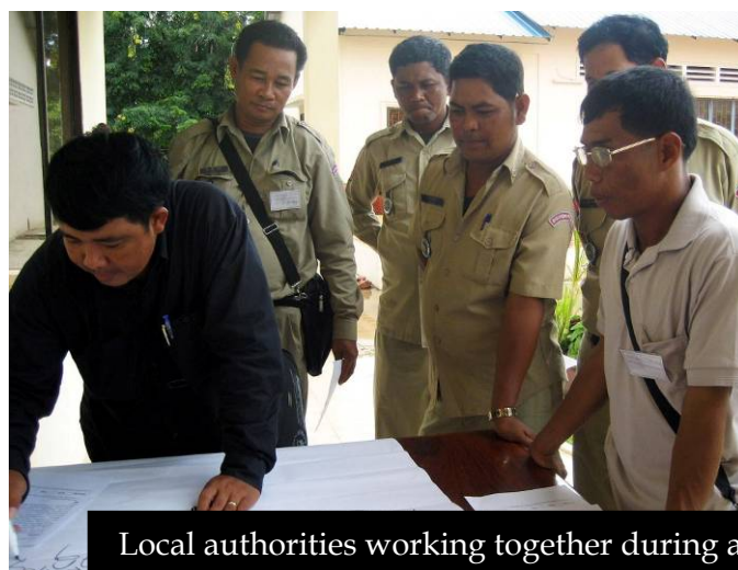
Local authorities working together during a training session

Local authorities were invited to participate in the Pilot Project. 25 local authorities from all eight villages were invited to participate in the Pilot Project, however only 23 local authorities accepted and agreed to attend training sessions and participate.