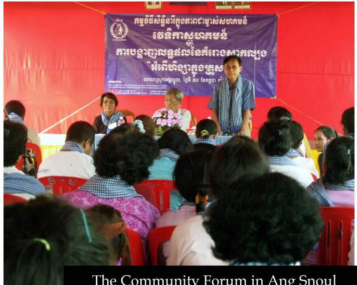
The Community Forum in Ang Snoul

The purpose of the community forum was to present feedback from the participants about the training sessions and the pilot project, as well as to present the results and conclusions of the evaluation. The results of the evaluation were presented to the participants of the pilot project, through the form of a drama, which incorporated results and comments from community members. The script for the drama is contained in the Appendix I.