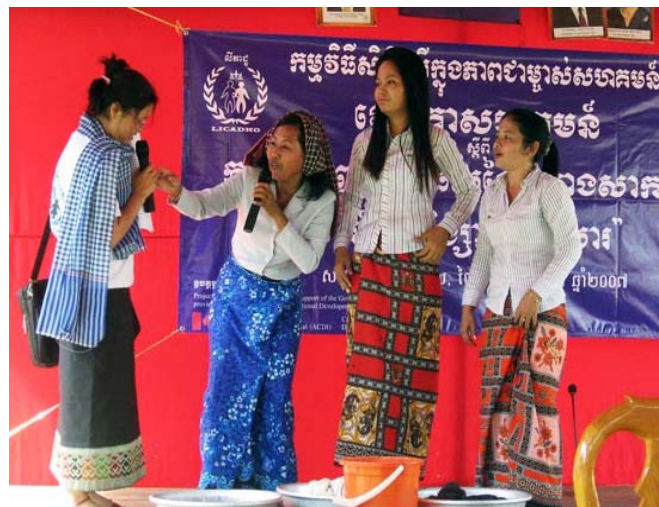
The drama being performed during the Community Forum in Ang Snoul