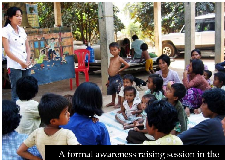
A formal awareness raising session in the community

Informal sessions were conducted with approximately 958 community members in the target areas. Informal sessions included meetings with people at the market places, discussions on violence against women issues during meals and conversations between neighbors, friends and family.