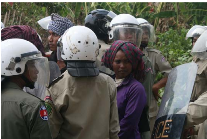
A woman stands among police officers attempting to stop Amleang villagers from reaching the court in Kampong Speu.

After the hearing the public prosecutor told them Senator Ly Yong Phat was too powerful to resist, because "half of the country owes him favors".