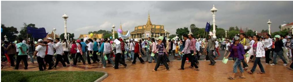
Workers march in front of Phnom Penh's Royal Palace on Labor Day, May 1, 2010.

international human rights standards, and that since “the Declaration was adopted by consensus by the General Assembly...[it] therefore represents a very strong commitment by States to its implementation.” 7