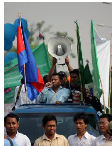
Workers march through Phnom Penh on May 1, 2010.

Furthermore, the restriction of protests on the sites of land evictions has increasingly led to violence. The inability of people to protect the areas where they have been living – sometimes for decades – often results in confrontational standoffs as they attempt to avoid eviction and relocation. These clashes with local authorities, police and military can lead to arrests, injury and death as they quickly become violent.