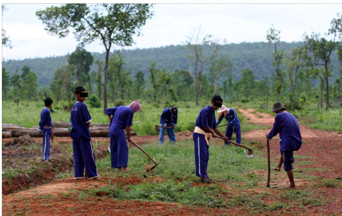
Prisoners clear land at Correctional Center 4 in Pursat Province.

Finally, although the prakas' ban on the export of prison-produced goods is welcome, it tackles only one aspect of the problem posed by Article 71 of the Law on Prisons. Under international law, the leasing of prison labor to private entities - even if the resulting products are only sold domestically - is a legal minefield. There are a number of checks and balances which must be in place. As of now, none of these are mandated in Cambodian law. Further legislation - and proper enforcement - is urgently needed on this front.