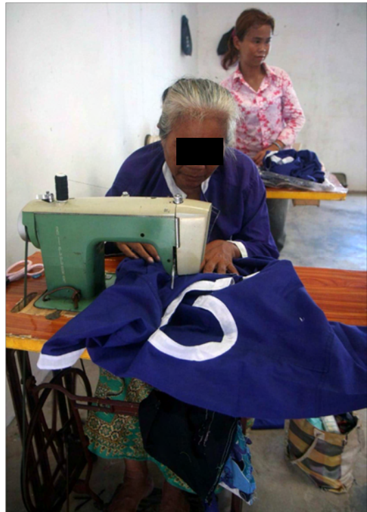
A prisoner sews inmate uniforms at Sihanoukville provincial prison.

But the reliance on money generated by inmate labor is worth keeping in mind when considering the impact that public-private labor partnerships might have. GDP has a strong financial incentive to exploit inmate labor, and money is likely the most significant factor driving the establishment of public-private prison labor partnerships. This fact militates strongly in favor of establishing strong protections to protect inmates’ rights under ILO Convention No. 29.