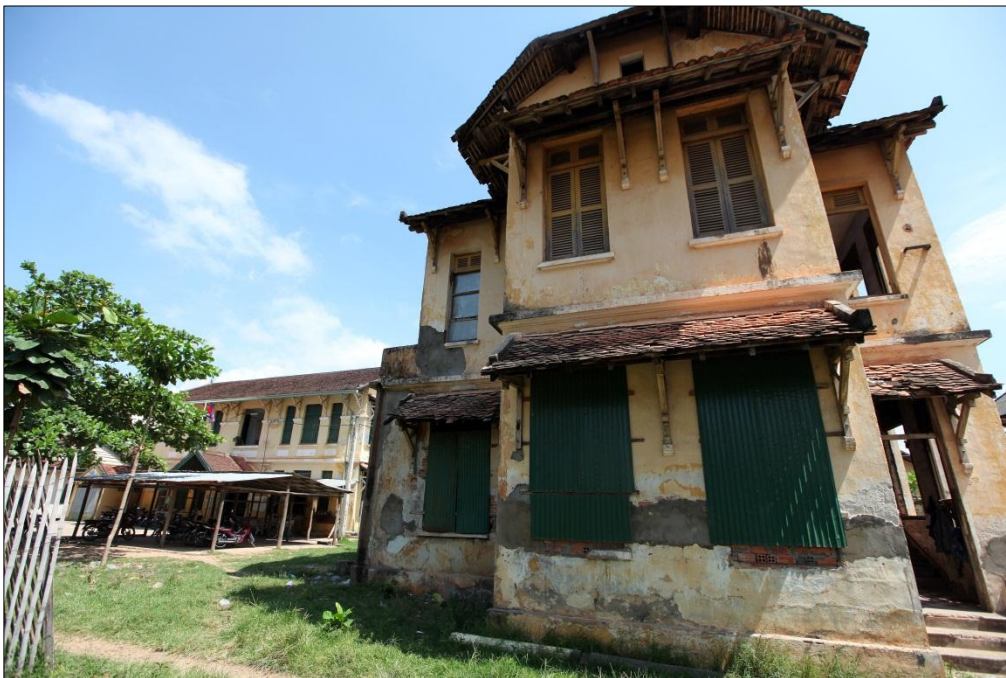
A colonial-era building lies in a decrepit condition inside Kampot prison. The prison was built in 1936, and as of May 2012, it held 454 inmates – over 280% of its rated capacity.

In the final section, we review key recommendations made in our 2010 and 2011 reports, and track the progress made toward fulfilling them.