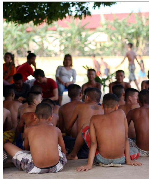
Alleged drug offenders at a drug rehabilitation center in Banteay Meanchey. Detainees are generally not allowed to leave.

This data was more specific than the numbers provided to LICADHO, separating drug crimes into five categories. It also painted an even darker picture: Inmates detained on drug-related charges nearly tripled in one year: