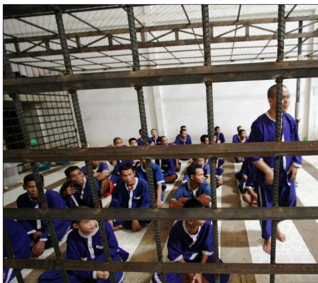
Male prisoners sit inside a cage at Pailin prison. The prison – housed in a former movie theater – opened in 2011 as a temporary facility, but construction on the permanent jail has yet to begin.

Many of these projects are likely years away from completion. Indeed, there is still no estimated completion date for the new Pailin prison, which is extremely urgent given that prisoners currently live an old movie theater. Conditions there are among the worst of all prisons in