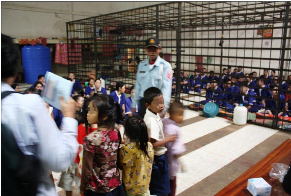
Incarcerated mothers and their children in Pailin prison. Male prisoners spend most of their day inside a cage, which is pictured in the background.

The arrest of drug users, in particular, is a problematic criminal justice strategy. Experts widely agree that drug users don't belong in detention. 20 Imprisoning drug users is an expensive, ineffective and dysfunctional approach to treatment. If the government is serious about drug treatment as an alternative to prison, it should consider community-based treatment programs, where participants are free to go home at night.