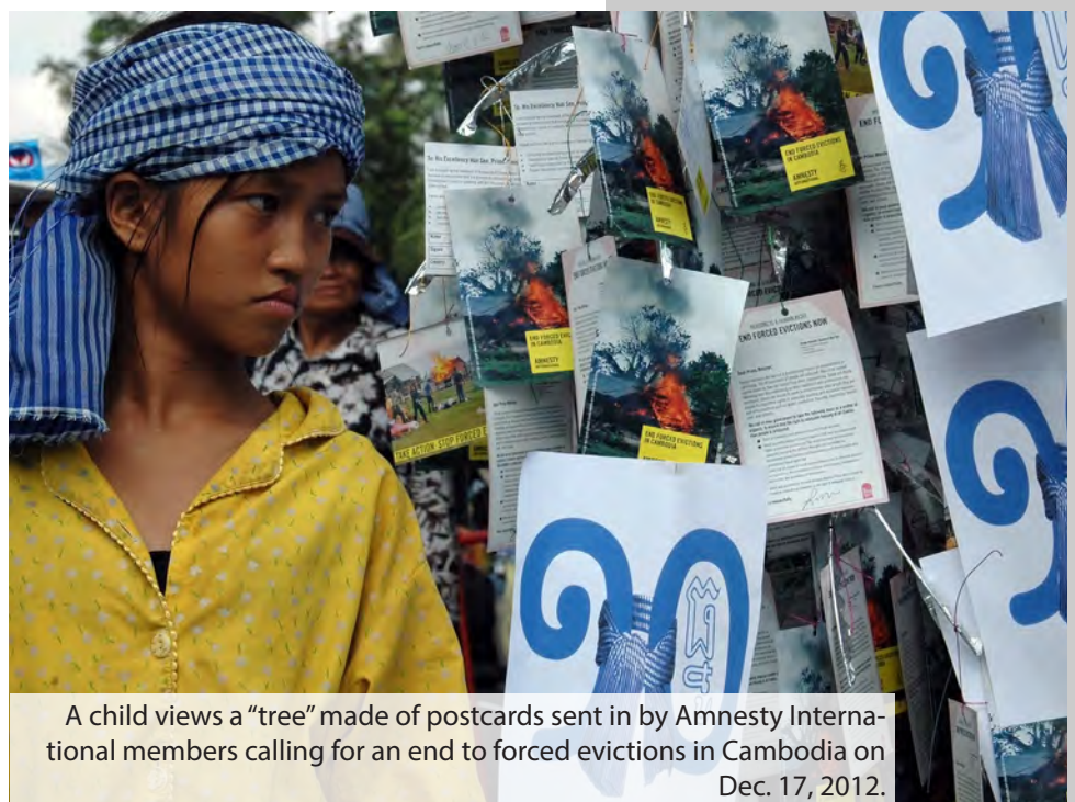
A child views a “tree” made of postcards sent in by Amnesty International members calling for an end to forced evictions in Cambodia on Dec. 17, 2012.