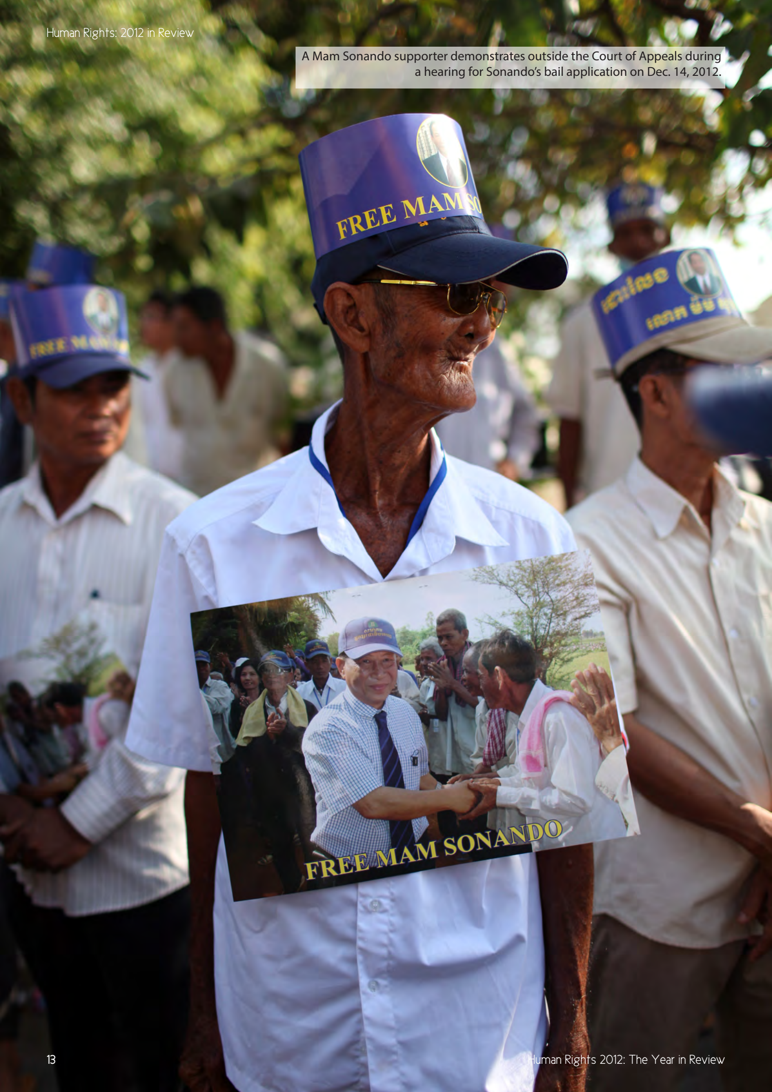
A Mam Sonando supporter demonstrates outside the Court of Appeals during a hearing for Sonando's bail application on Dec. 14, 2012.