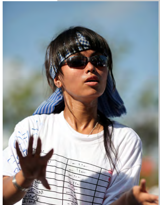
A woman performs a land rights-themed “Gangnam Style” dance with others in front of the National Assembly in Phnom Penh on Dec. 17, 2012.

The event concluded with organizers and volunteers dancing to a land-rights themed rendition of “Gangnam-style” in front of the National Assembly wearing the T-shirt petitions. LICADHO commissioned the production of a video documenting IHRD 2012 – including the dance – which is currently online.