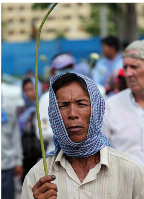
World Environment Day, June 5, 2012, Phnom Penh.