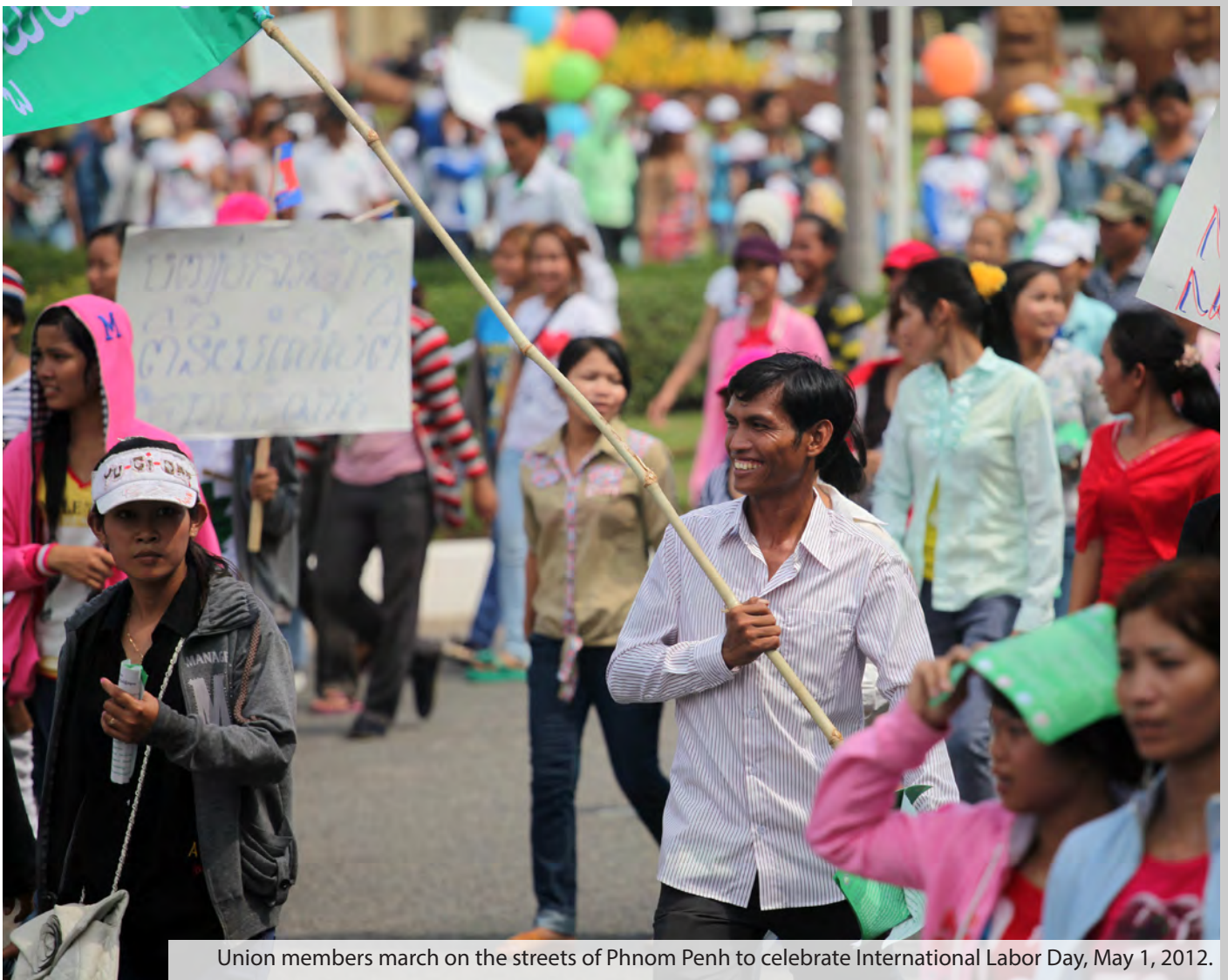
Union members march on the streets of Phnom Penh to celebrate International Labor Day, May 1, 2012.

In December, with the publication of the report "Attacks & Threats Against Human Rights Defenders in Cambodia 2010-12," LICADHO began a gradual rollout of a new design for its printed materials. The evolution continues with this annual report.