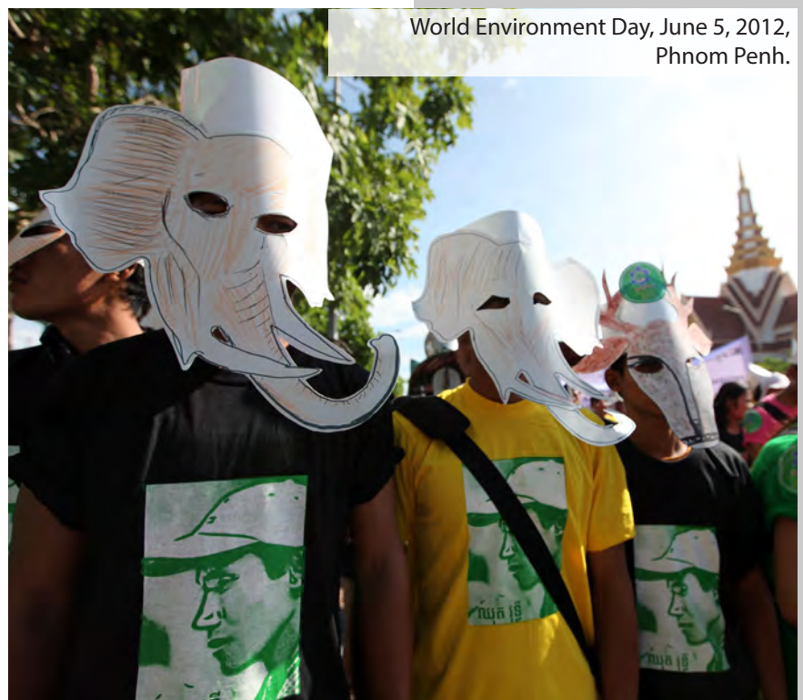
World Environment Day, June 5, 2012, Phnom Penh.