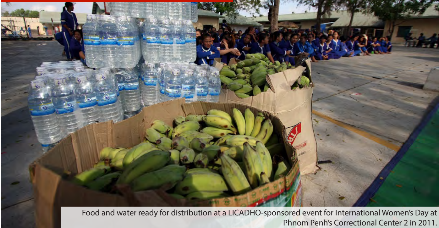
Food and water ready for distribution at a LICADHO-sponsored event for International Women's Day at Phnom Penh's Correctional Center 2 in 2011.