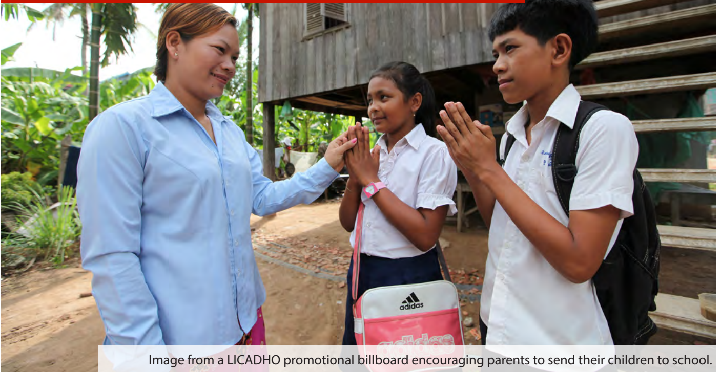
Image from a LICADHO promotional billboard encouraging parents to send their children to school.