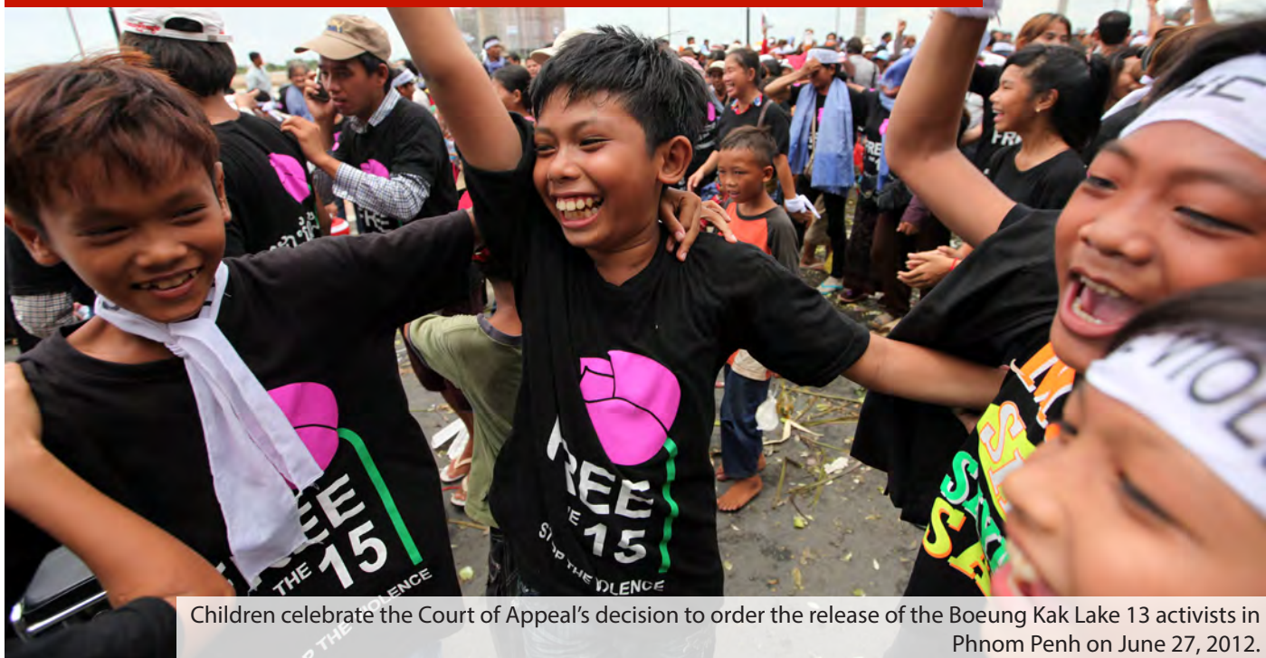
Children celebrate the Court of Appeal's decision to order the release of the Boeung Kak Lake 13 activists in Phnom Penh on June 27, 2012.