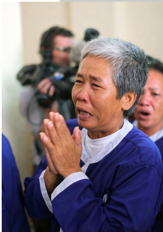
One of the Boeung Kak Lake defendants reacts after the appeal court decision is announced.