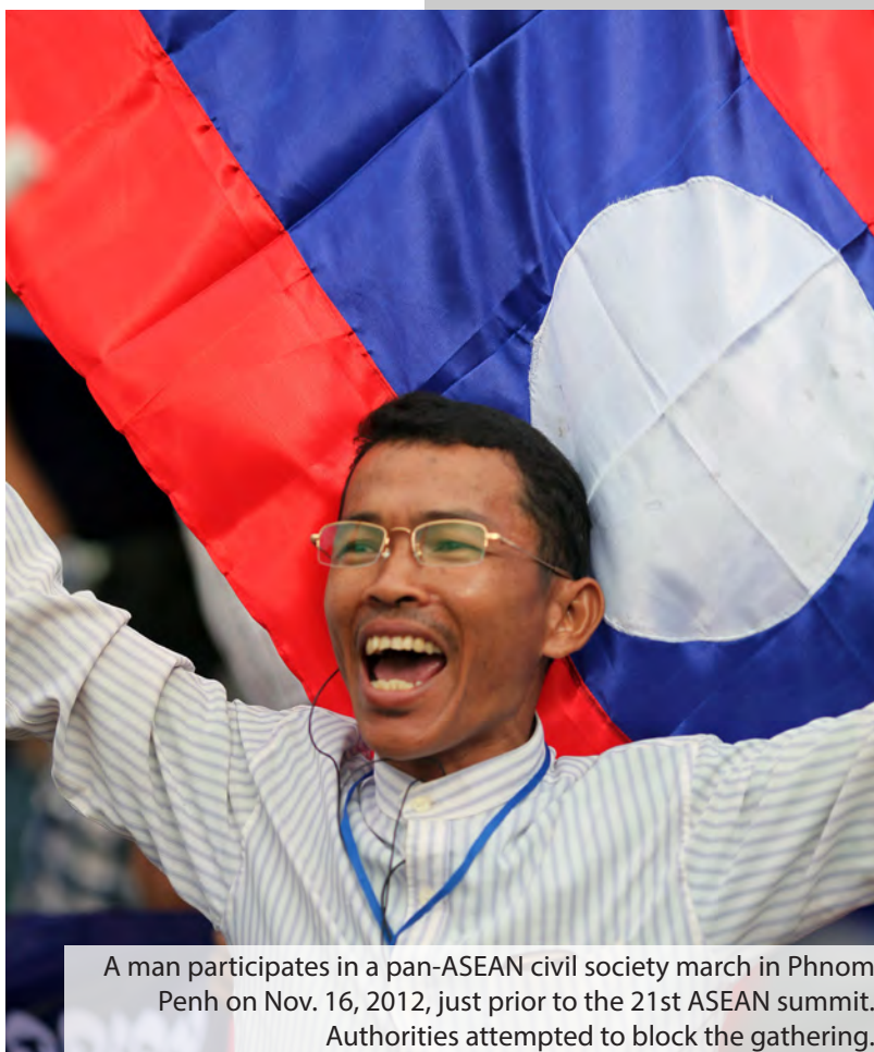
A man participates in a pan-ASEAN civil society march in Phnom Penh on Nov. 16, 2012, just prior to the 21st ASEAN summit. Authorities attempted to block the gathering.

Size of land concession granted to the Chinese firm Union Development Group in Koh Kong to develop a US $3.8 billion "tourism zone"