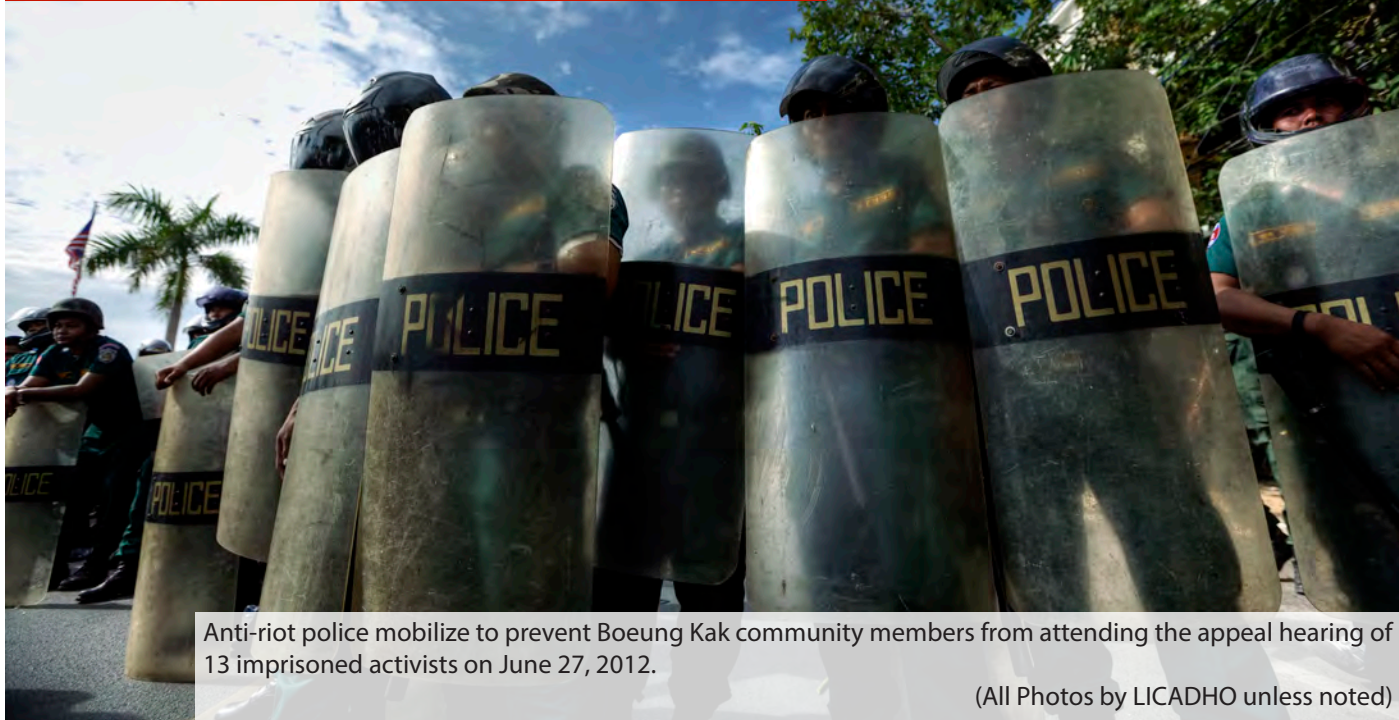
Anti-riot police mobilize to prevent Boeung Kak community members from attending the appeal hearing of 13 imprisoned activists on June 27, 2012.