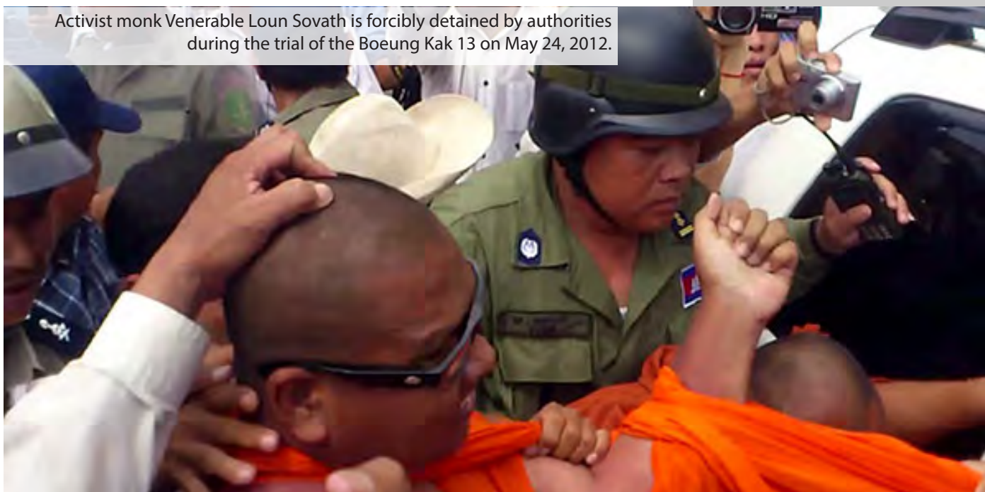
Activist monk Venerable Loun Sovath is forcibly detained by authorities during the trial of the Boeung Kak 13 on May 24, 2012.