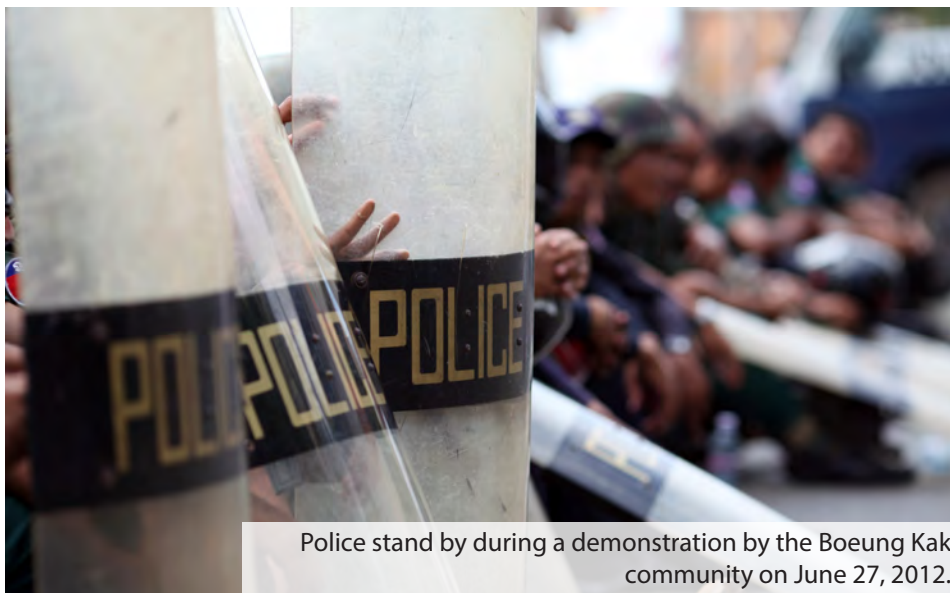
Police stand by during a demonstration by the Boeung Kak community on June 27, 2012.

two women who died after being raped. Domestic violence accounted for 66.07% of all cases. More women are seeking justice for violence directed towards them.