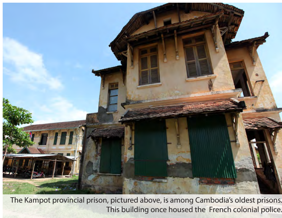
The Kampot provincial prison, pictured above, is among Cambodia's oldest prisons. This building once housed the French colonial police.

The Medical Project also provides extra food for pregnant women, babies, children the elderly and critically ill individuals and human rights defenders. ■