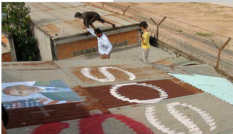
Rooftop of an airport-area resident bearing an SOS message to US President Barack Obama. The residents were arrested and detained.

On November 12, the Ministry of Interior stated