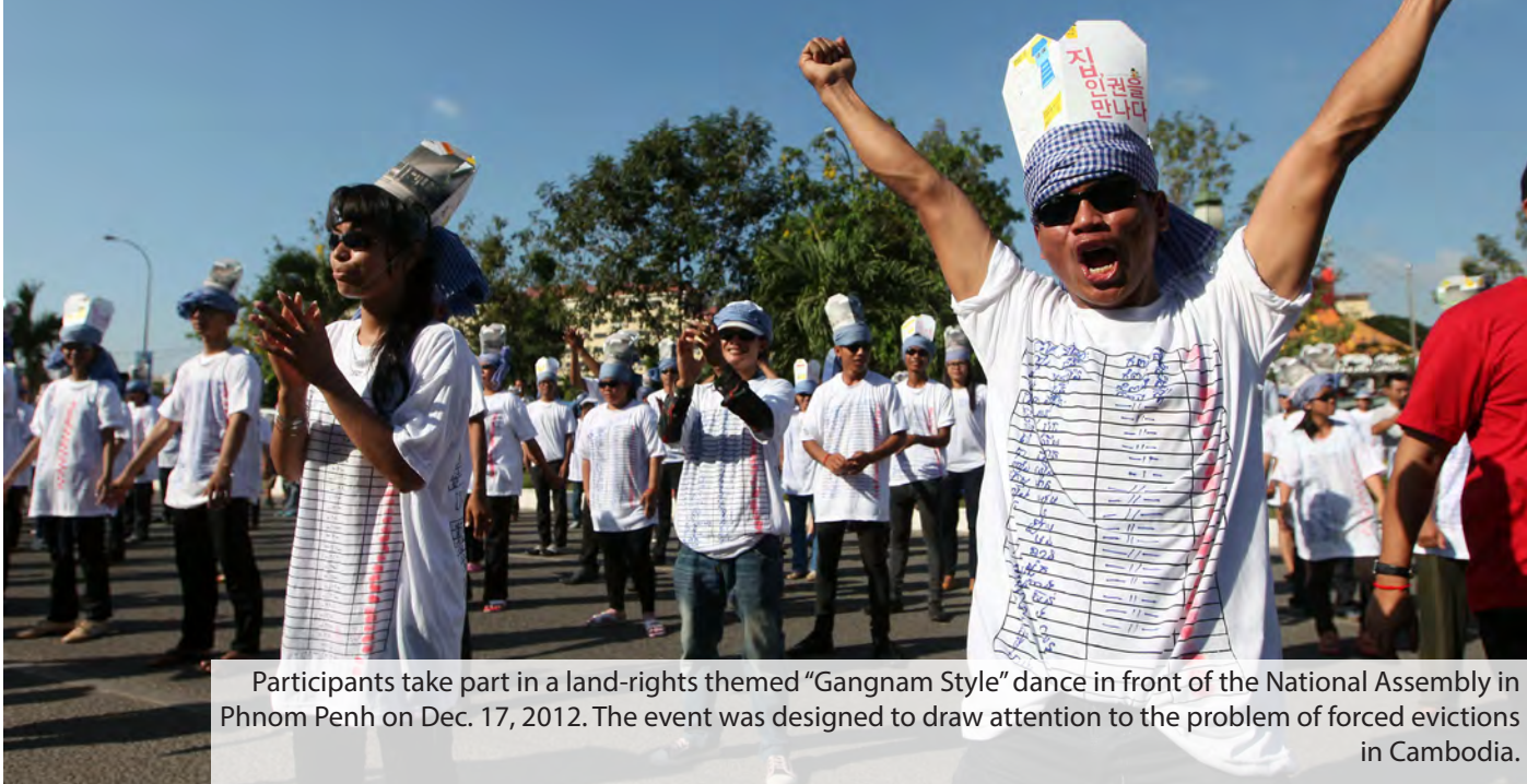
Participants take part in a land-rights themed “Gangnam Style” dance in front of the National Assembly in Phnom Penh on Dec. 17, 2012. The event was designed to draw attention to the problem of forced evictions in Cambodia.