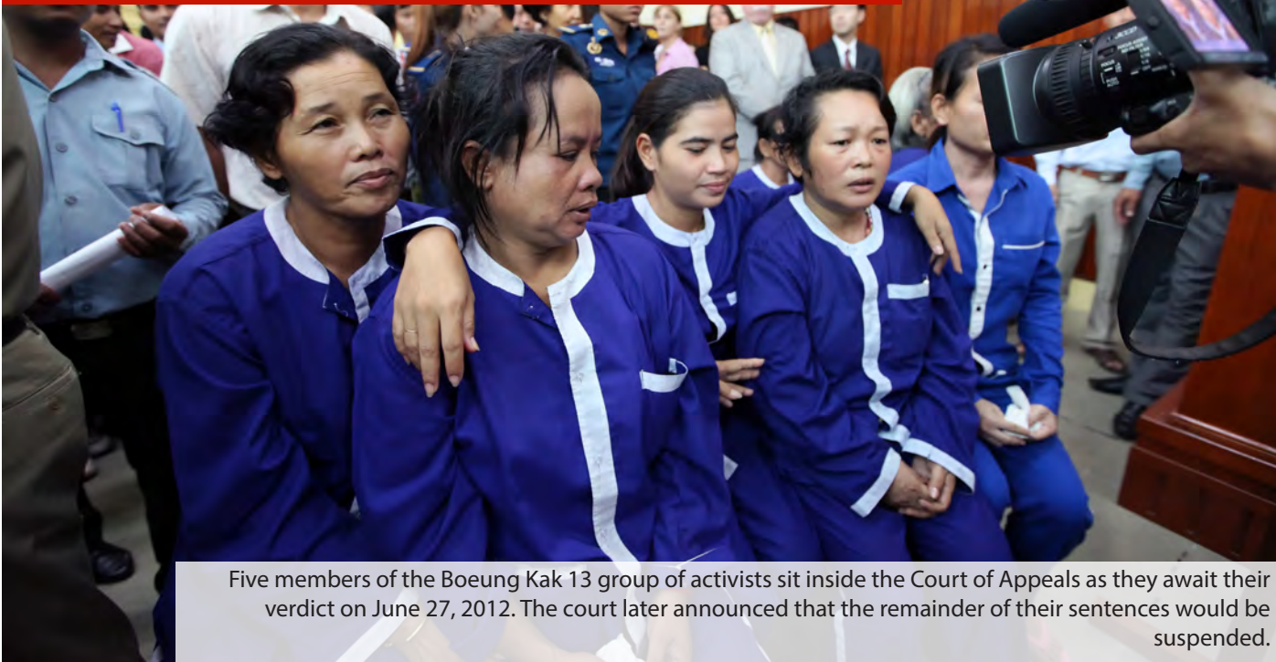
Five members of the Boeung Kak 13 group of activists sit inside the Court of Appeals as they await their verdict on June 27, 2012. The court later announced that the remainder of their sentences would be suspended.