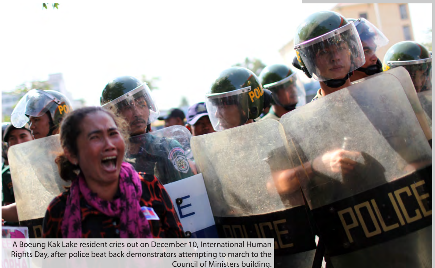
A Boeung Kak Lake resident cries out on December 10, International Human Rights Day, after police beat back demonstrators attempting to march to the Council of Ministers building.

LICADHO has also closely monitored the status of inmates in the provinces who are unable to attend their appeals hearings in Phnom Penh, despite being guaranteed that right under law. In a 2012 report , LICADHO found that nearly 800 inmates with pending appeals were held in 11 provincial prisons surveyed by LICADHO. At the time, the General Department of Prisons had virtually no means to transport these prisoners to their appeal hearings in Phnom Penh. However, since the publication of the report, a small-scale transport system has begun operations.