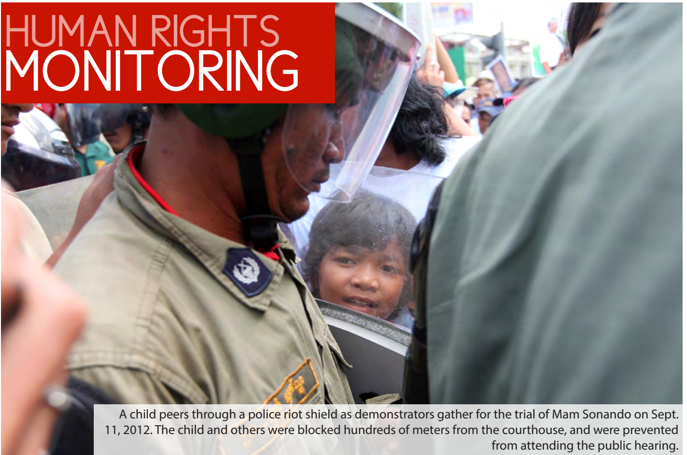
A child peers through a police riot shield as demonstrators gather for the trial of Mam Sonando on Sept. 11, 2012. The child and others were blocked hundreds of meters from the courthouse, and were prevented from attending the public hearing.