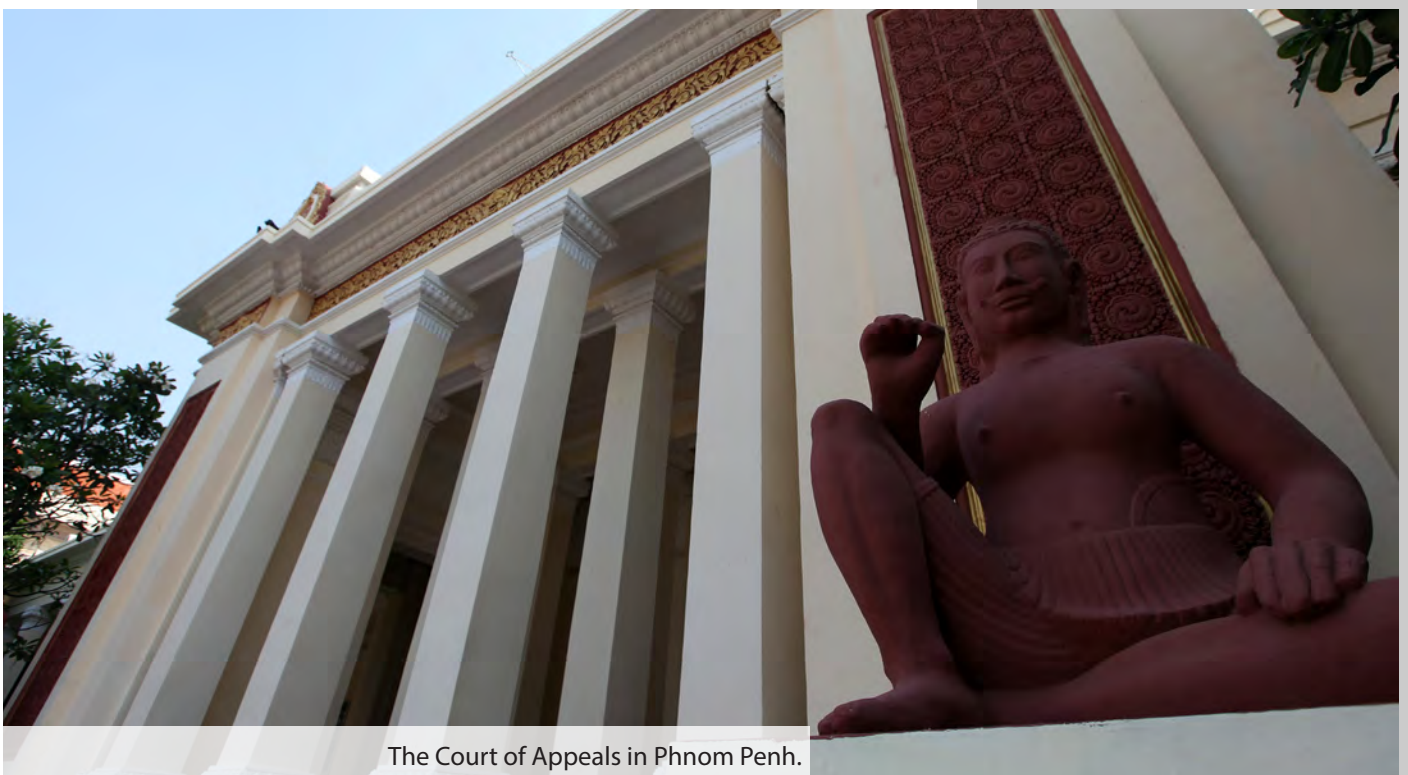
The Court of Appeals in Phnom Penh.