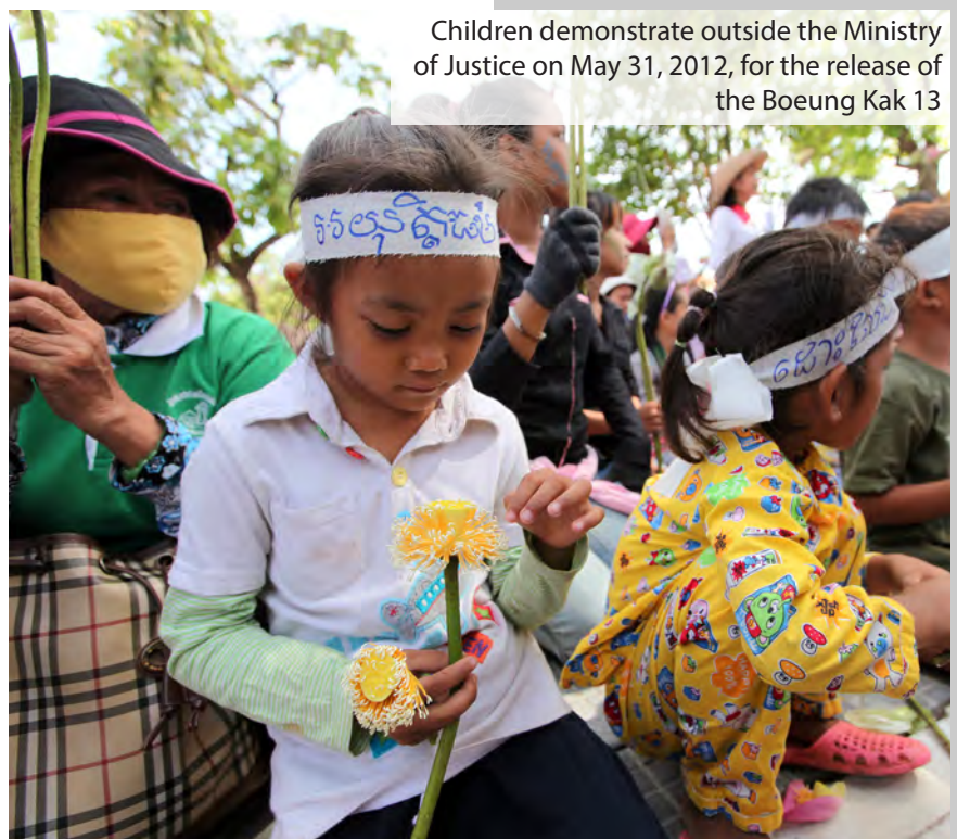
Children demonstrate outside the Ministry of Justice on May 31, 2012, for the release of the Boeung Kak 13