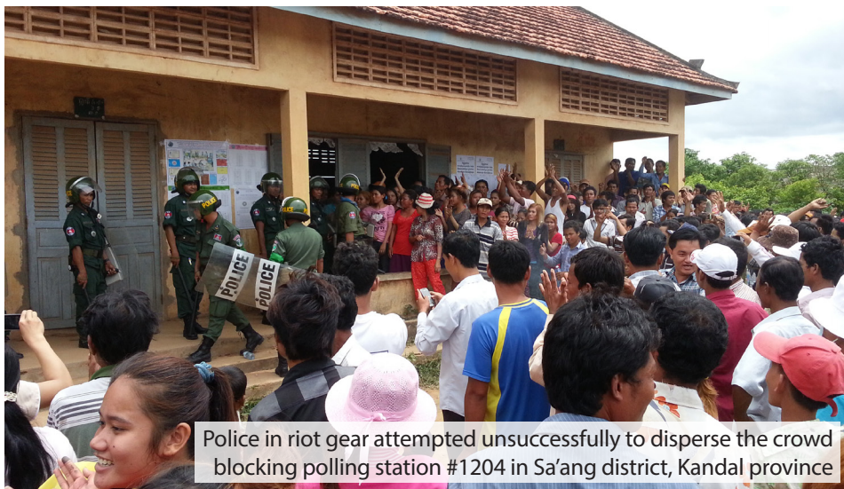
Police in riot gear attempted unsuccessfully to disperse the crowd blocking polling station #1204 in Sa'ang district, Kandal province

LICADHO received reports that CPP members were bringing villagers to vote in polling stations #0066 and #0067, and then staying near the station counting voters. A stunning 96% of the people listed voted at these two stations.