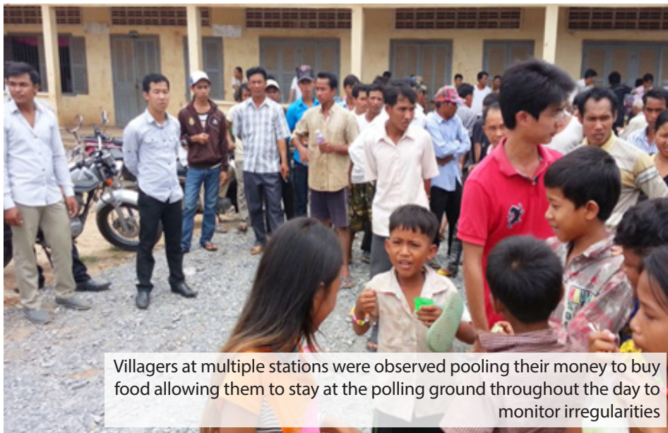
Villagers at multiple stations were observed pooling their money to buy food allowing them to stay at the polling ground throughout the day to monitor irregularities

While LICADHO didn't witness the incident first-hand, monitors saw a significant number of military police and police who stayed behind at the entrance of the school and confirmed the incident with other observers.