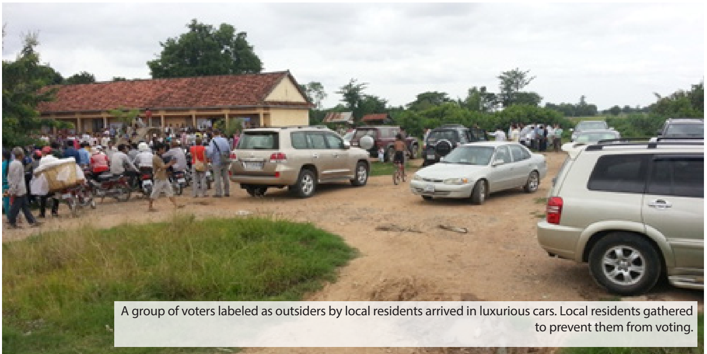
A group of voters labeled as outsiders by local residents arrived in luxurious cars. Local residents gathered to prevent them from voting.

In multiple instances, LICADHO monitors observed large groups of individuals arriving all at once to vote in communes where they were admittedly ineligible to vote. They often arrived in convoys of luxury vehicles. The fact that the names of individuals in these groups appeared on the voter rolls, often in newly created polling stations and despite them admitting they did not and had never resided in those communes, lends troubling credence to allegations of intentional registration fraud. These incidents must be genuinely and independently investigated.