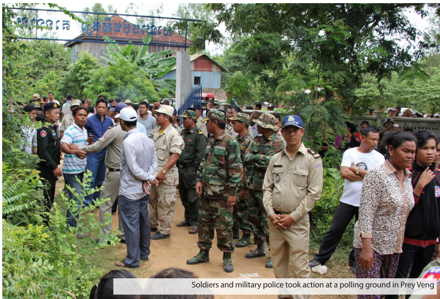
Soldiers and military police took action at a polling ground in Prey Veng

At Ampil Krau School, Ampil Krau commune, armed forces mobilized to prevent citizens from protesting against reportedly ineligible voters at polling stations #0982 and #0981.