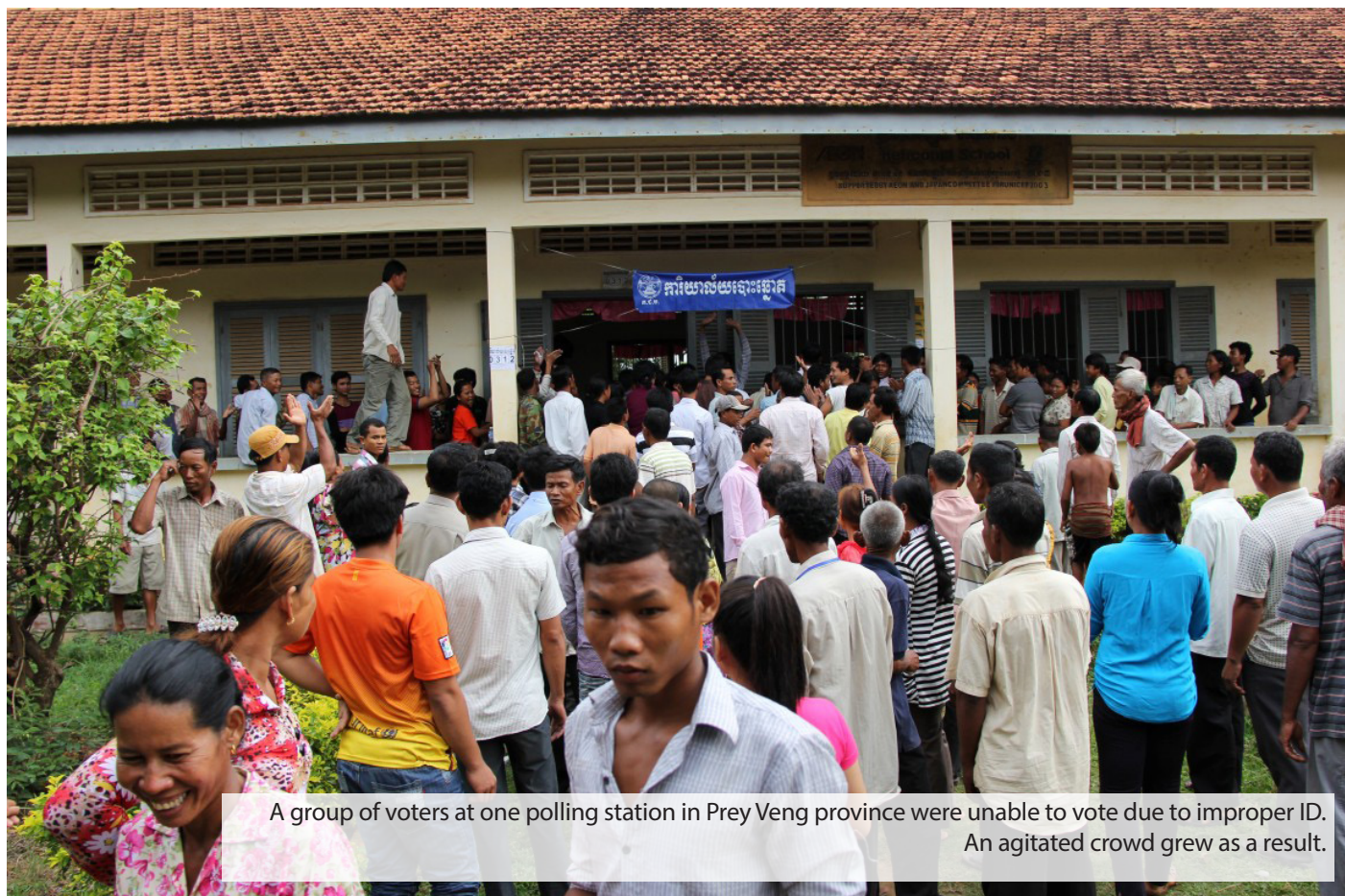
A group of voters at one polling station in Prey Veng province were unable to vote due to improper ID. An agitated crowd grew as a result.

According to several observers, many names at Bak Touk High School were inexplicably missing from the voter rolls. People who were being sent away became quite agitated. One man who was not allowed to vote offered to gather names, and was reportedly threatened with arrest for this action, which increased the crowd's discontent.