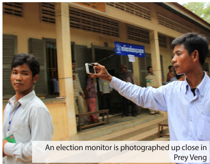
An election monitor is photographed up close in Prey Veng

Preak Kuy commune's over-registration is among the worst in Kandal province, with a rate of 139.63%. A visit to the commune by LICADHO investigators prior to election-day confirmed the over registration issue as local commune council members from SRP and HRP were worried about the high number of names in comparison to the number of residents in the commune.