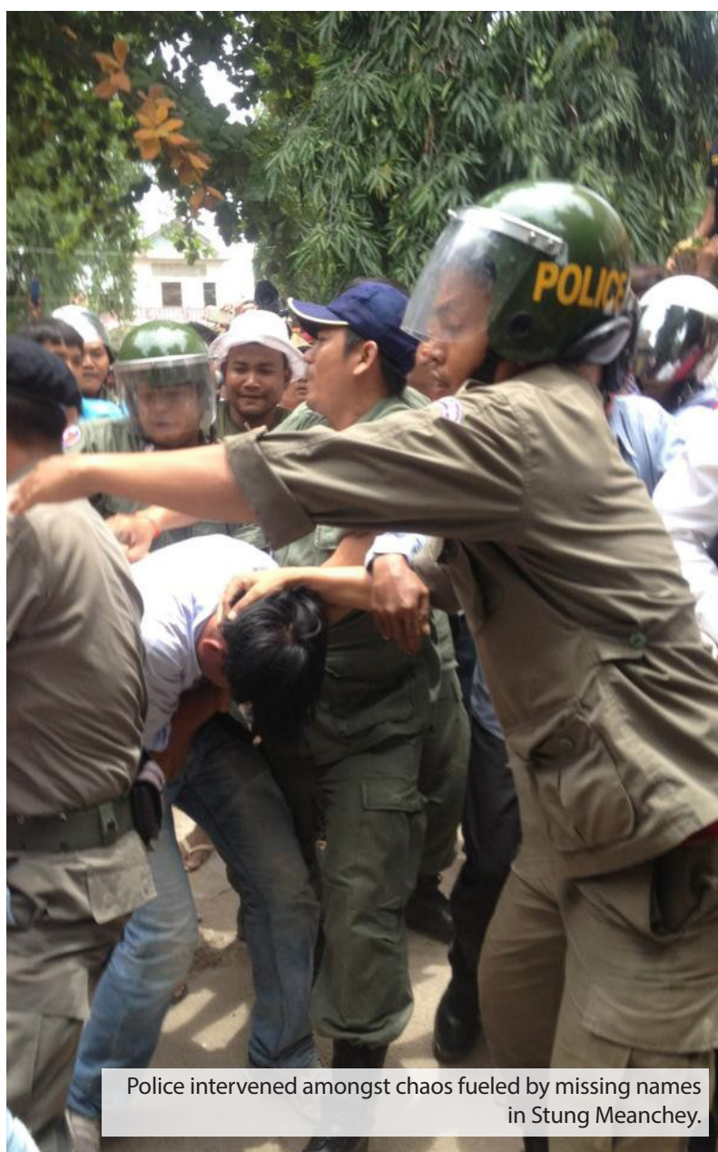
Police intervened amongst chaos fueled by missing names in Stung Meanchey.

Rumors soon began to circulate that a monk who was being interviewed by a journalist about missing voter names was assaulted. Bystanders claimed to have found the individual responsible for that beating, and pointed the allegedly responsible party out to the authorities. The authorities removed the accused. The local residents then attempted to file an official complaint about the violence to the CEC official responsible for the polling ground. In response, the CEC official went into the room being used as her office and locked herself in. The official was seen moving around inside the room, thus allegations of fainting made in the media appear unfounded.