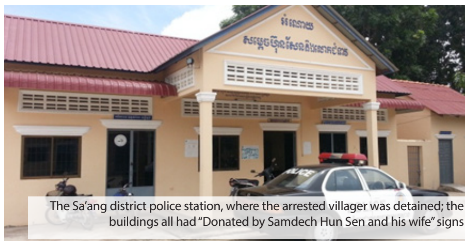
The Sa'ang district police station, where the arrested villager was detained; the buildings all had "Donated by Samdech Hun Sen and his wife" signs

This incident clearly reveals an example of intentional, preplanned fraud on the part of officials charged with administering the voter rolls. It also provides a concrete example of individuals who have voted in previous elections and were prevented from voting in this election despite desiring to do so, as they were apparently prevented from traveling to the polling stations where they were legally registered. Again, the enormously high percentage of duplicate voters in this commune further corroborates these observations.