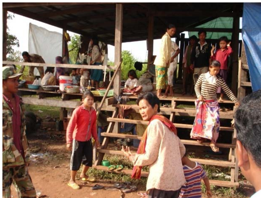
Evicted families in a public shelter near Chouk Meas village

12 Oct 2009: After their removal from Kocktlok pagoda, the evicted families regroup at public shelters (sala chhor tian) along the roadside, where they are monitored by police, military police and RCAF personnel. The humanitarian situation of the families remains critical, many lack basic food supplies, mosquito nets and tarpaulins.