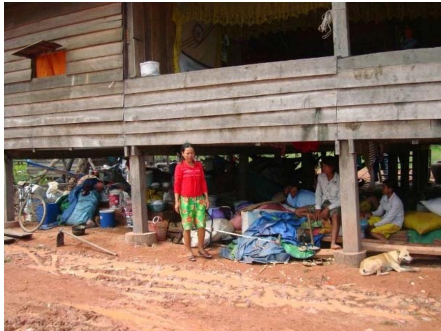
Evictees seeking refuge in Kocktlok pagoda

pagoda reporting the use of force and coercion in the process. In the evening all families are reported to have vacated the pagoda premises.