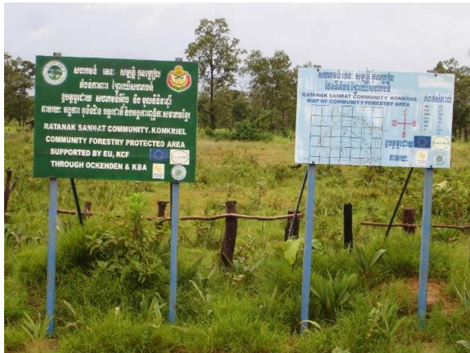
Signboards indicating community forestry projects in Konkriel

2006: Supported by the EU and Ockenden, there are ongoing efforts with the aim to establish community forestry projects in the area, in close cooperation with the provincial governor and the relevant forestry authorities.