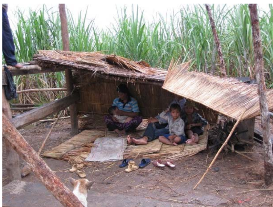
Villagers in the remnants of their former homes

RCAF troops from Battalion 42 set up roadblocks at the entrances of Bos/O'Bat Moan village and start bulldozing and burning down around 100 houses. Observers are prevented from entering the village. The provincial police chief, Mr. Men Ly later claims that rights workers had free access to the site and denied allegations that any houses were destroyed or burned. He said that the armed forces came to " remove tents ". Female villagers and children in most parts seek refuge at Koktlok pagoda in neighbouring Koktlok village. Monitors report that most of the men took to the forests in fear of retribution by armed forces and possible arrests. LICADHO monitors continue to investigate the legal grounds on the basis of which the authorities ordered the forced eviction. The level of damage to private property caused by the mixed forces and the demolition gangs is also being assessed.