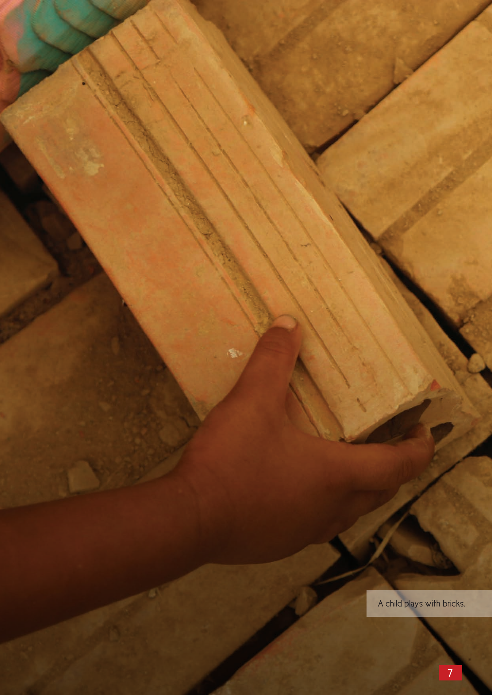
A child plays with bricks.